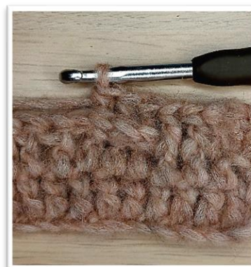
(3 bp, picture 10)