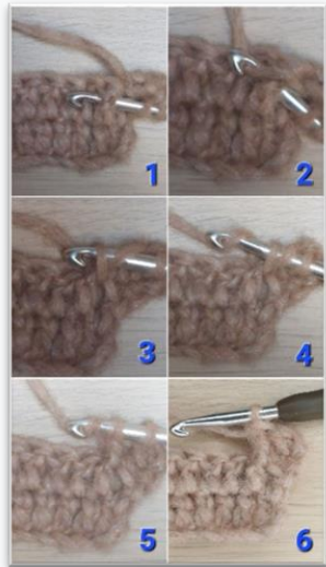
(fp, picture 7)

front post(fp): you crochet a double crochet, but not using the regular stitch, you crochet around the post of the stitch. Yo, insert crochet hook on the right side around the post of the stitch (at the front of your work) and to the left of the stitch your needle reappears. Yo, pull thread through the stitch (3 loops on your hook), yo, crochet the first two loops (2 loops on your hook), yo, crochet the remaining two loops. (see picture 7 and 8)