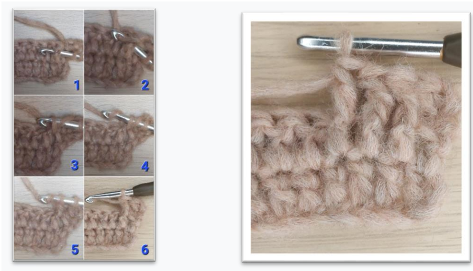
(fp, picture 8)

front post(fp): you crochet a double crochet, but not using the regular stitch, you crochet around the post of the stitch. Yo, insert crochet hook on the right side around the post of the stitch (at the front of your work) and to the left of the stitch your needle reappears. Yo, pull thread through the stitch (3 loops on your hook), yo, crochet the first two loops (2 loops on your hook), yo, crochet the remaining two loops. (see picture 8 and 9)