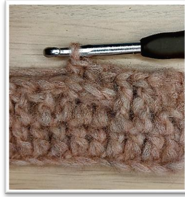
(3 bp, picture 11)

Use a stitch marker at the point of the shawl so that you can easily find it when crocheting.