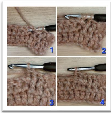
(bp, picture 10)