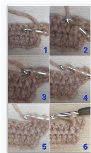
(fp, picture 8)

front post(fp): you crochet a double crochet, but not using the regular stitch, you crochet around the post of the stitch. Yo, insert crochet hook on the right side around the post of the stitch (at the front of your work) and to the left of the stitch your needle reappears. Yo, pull thread through the stitch (3 loops on your hook), yo, crochet the first two loops (2 loops on your hook), yo, crochet the remaining two loops. (see picture 8 and 9)