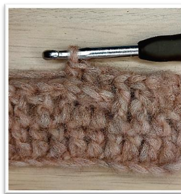
(3 bp, picture 11)

Use a stitch marker at the point of the shawl so that you can easily find it when crocheting.