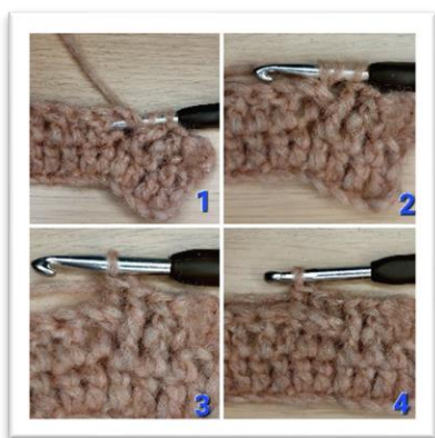
(bp, picture 10)