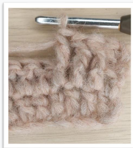
(3 fp, picture 9)

back post(bp): same as the fp but you are now working on the backside of your work. Yo, insert crochet hook on the right side around the post of the stitch ( at the backside of your work ) and to the left of the stitch your needle reappears. Yo, pull thread through the stitch (3 loops on your hook), yo, crochet the first two loops (2 loops on your hook), yo, crochet the remaining two loops. (see picture 10 and 11)